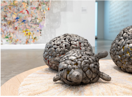
Venetia Dale, Venetia Dale , 2023-24. Installation view, 2023 Foster Prize , the Institute of Contemporary Art/Boston, 2023-24.